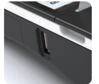
Data archiving on a USB flash disk, USB scanner and drawer handling