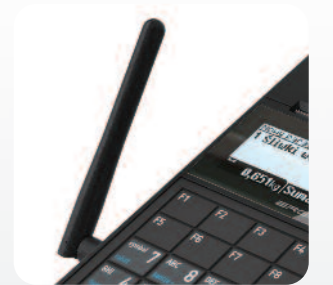
Additional wireless communication interfaces