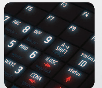
Backlit, spill-resistant keyboard