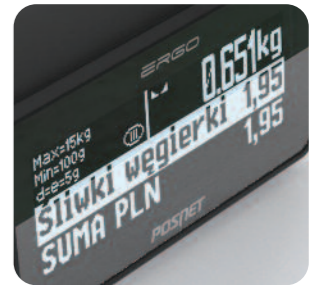
Graphic handling and customer's displays

The function of programming the reminders allows the user to decide what should the cash register remember about. At the time indicated, the device will print and display a message and remind about an important matter, e.g. the need to execute a monthly report, the date of tax payment or the manager's birthday.