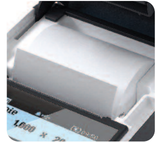
Easy replacement of paper "drop in & print"